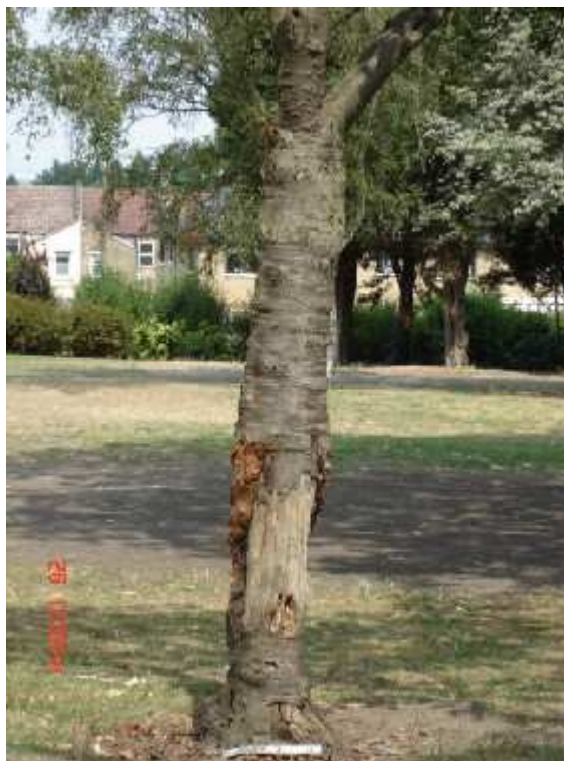
Example of damage done to trees by dogs