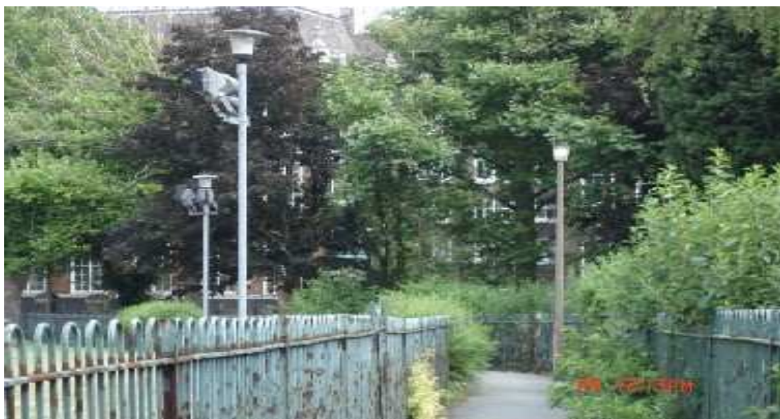
Walkway between Churchyard and Gardens